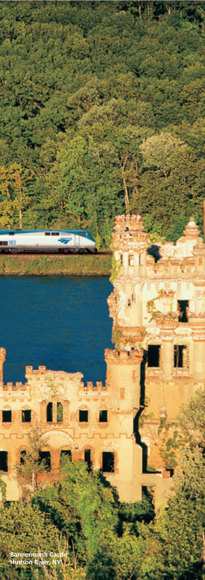
Bannerman's Castle Hudson River, NY

Welcome aboard the Vermont or Ethan Allen Express . From the flash of Broadway, the monuments of the nation's capital to the scenic vistas, snow-capped mountains and glistening valleys of New England, the Vermont and the Ethan Allen Express take you through historic towns, stunning landscapes and gorgeous natural wonders on two fabulous journeys through America's mid-Atlantic and New England regions.